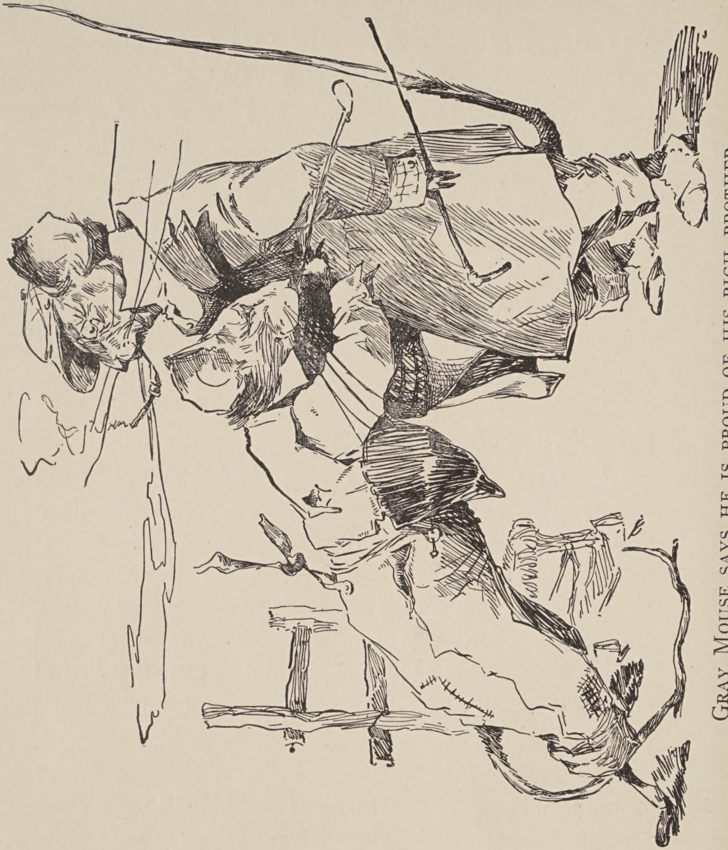
GRAY MOUSE SAYS HE IS PROUD OF HIS RICH BROTHER.